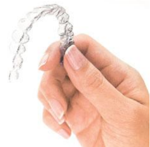
Invisalign Removable Clear Aligners